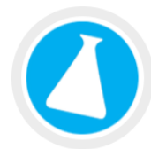
ARCHA SRL & TECHA SRL