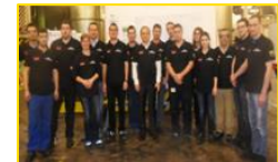
PMS Suggestion System