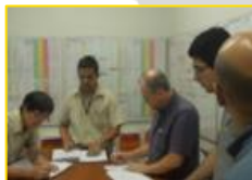
Pirelli Operation Steering system