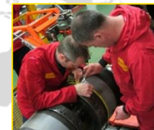
Cycle time reduction